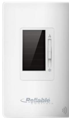
SPACE-Sensor EnOcean with Heat/Cool Slider