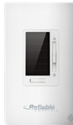
SPACE-Sensor EnOcean with One Button and Heat/Cool Slider