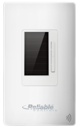
SPACE-Sensor EnOcean with One Button