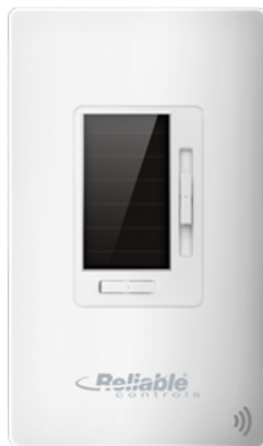
SPACE-Sensor EnOcean with One Button and Slider