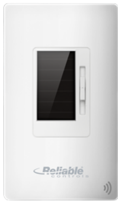
SPACE-Sensor EnOcean with Slider