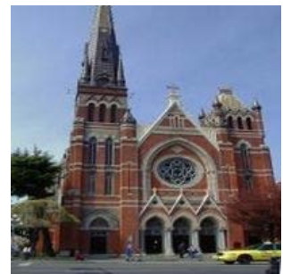
St. Andrews Cathedral (Canada)