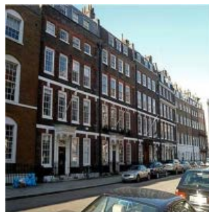
Queen Annes Gate (UK)