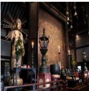
Taimadera Buddhist Temple (Japan)