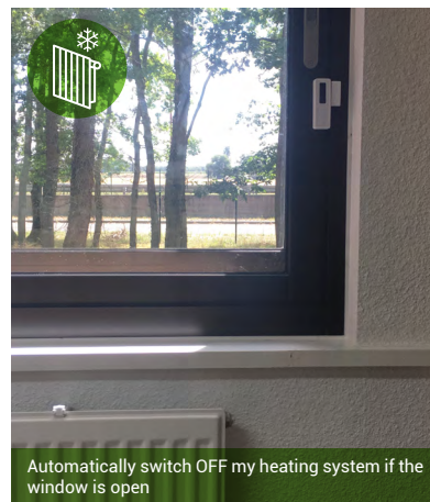
Automatically switch OFF my heating system if the window is open