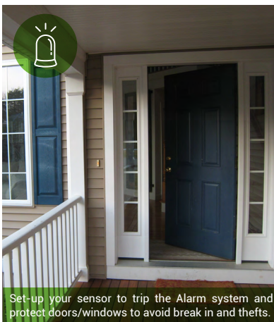
Set-up your sensor to trip the Alarm system and protect doors/windows to avoid break in and thefts.