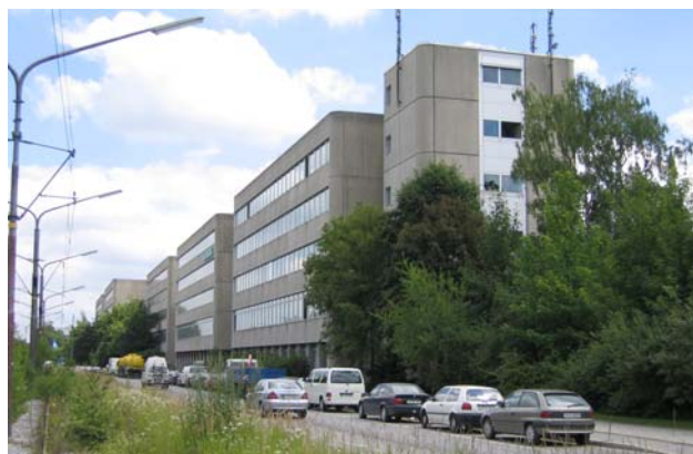
Siemens Munich: light and blind control in eleven office buildings using EnOcean radio sensors.

Inside blinds reduce glare. Contrary to outside shutters and blinds, however, they are not as effective in preventing the room from heating up in summer. Outside shutters and awnings thus reduce the energy requirement for air-conditioning systems, but also require flexible operation directly at the workplace or from the living room couch. Radio controls, therefore, win more and more recognition. Currently, a total of 25% of all electric roller blinds and 60% of all awnings in Europe are already operated by radio control (source: IO Homecontrol).